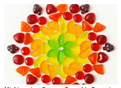
Michigan in a Frenzy : Cannabis Gummies Discovery Leaves Doctors Speechless

(https://trends.revcontent.con d=4W0%2FFD8cGB4y2HnGo7oı