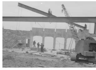
58 Commencements, Van Cliburn and Lynyrd Skynyrd: A History Of Interlochen's Kresge

(https://trends.revcontent.con d=qg9auTHx64JeUJfsbk1Hwk40