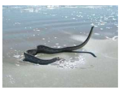
The Animal Most Likely to Kill You in Every State, Michigan is Terrifying Definition

(https://trends.revcontent.cond=SlwEBUvH3bDIL4ll%2BocrH)