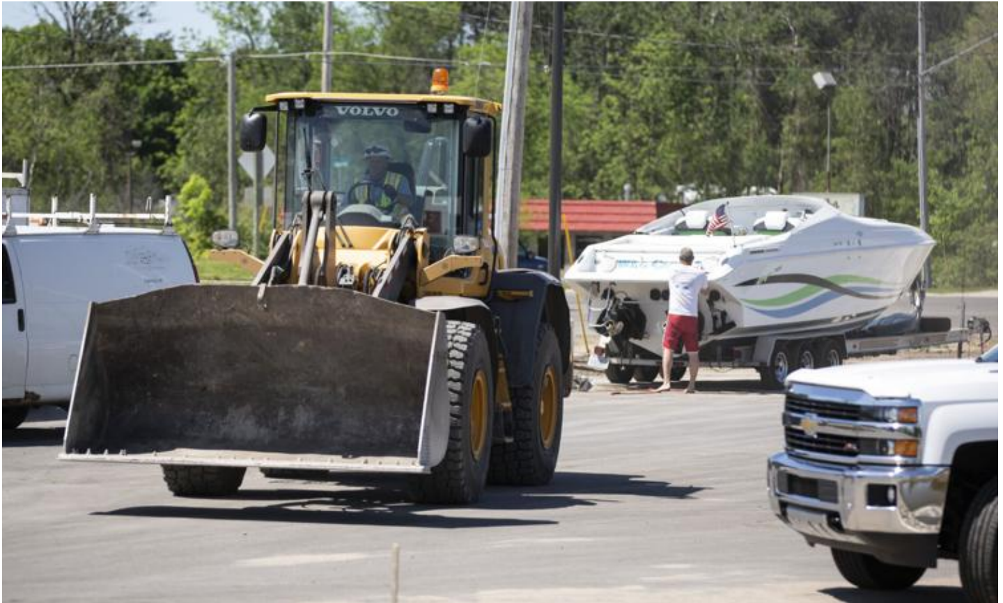
A Team Elmer's front-loader drives past a boat at Elmwood Marina in Traverse City on Thursday.