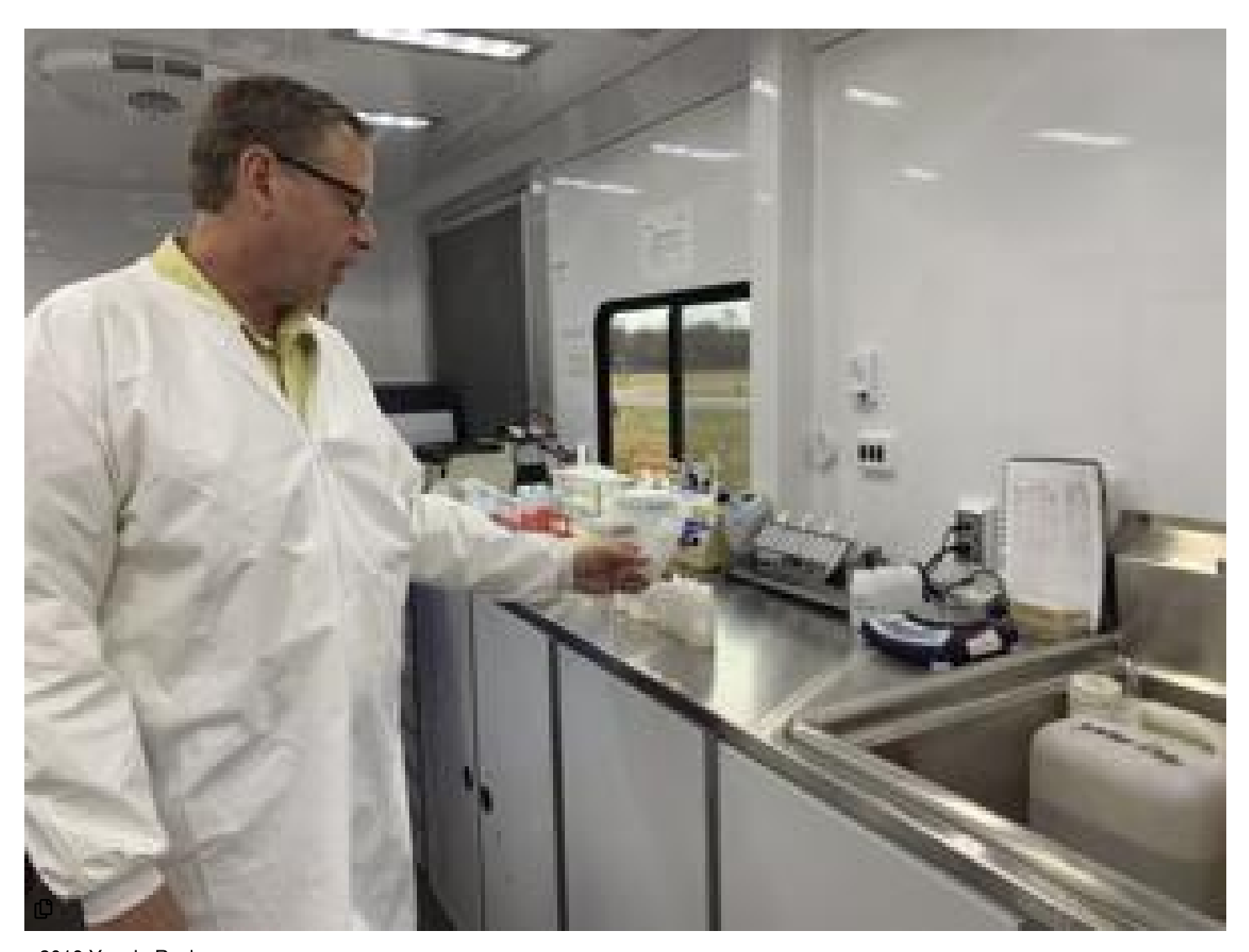
2019 Year in Review

"The street design itself is something that's new, so I'm really curious to see what happens," he said. "I do feel, I have not quantified it, but I do feel there's a lot more activity of walking and biking, even in the wintertime."