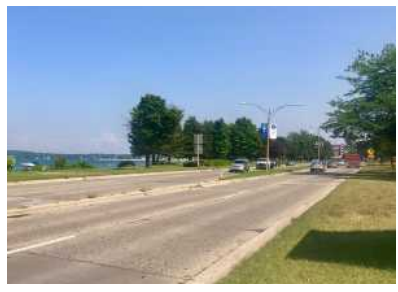
Outside Attorney Determines City Approval Required For Grandview Parkway Design

(https://trends.revcontent.con d=kE%2BQlfVOSsr5Amm9TyqV