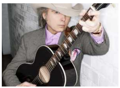
Dwight Yoakam, Home Free Added To Cherry Fest Lineup

(https://trends.revcontent.con d=IM3ul3YO%2B7CZ%2FjAlyj%