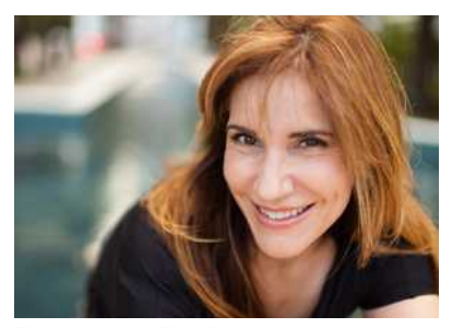
These Are the Top Financial Advisors in Traverse City

(https://trends.revcontent.con d=kE%2BQlfVOSsr5Amm9TyqV