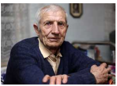
Michigan Seniors with No Life Insurance Get a $250k Policy for $18/month

(https://trends.revcontent.con d=jSAdOjYDxeKwBfqv%2BvVaI