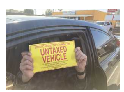
Michigan Launches New Rules for Cars Used Less Than 50 Miles/day BindRight

(https://trends.revcontent.con d=2AWpAxrwrJ0zW4lkIS6MbED