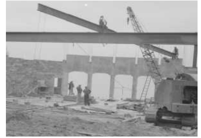
58 Commencements, Van Cliburn and Lynyrd Skynyrd: A History Of Interlochen's Kresge

( https://trends.revcontent.com/d=8A9bu21fp15Y3G0s%2F8KN4 )