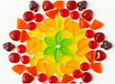
Michigan in a Frenzy : Cannabis Gummies Discovery Leaves Doctors Speechless

( https://trends.revcontent.com/d=D%2Fx62H9ct2Hitjdt5L4Yz7C )