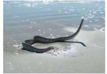
The Animal Most Likely to Kill You in Every State, Michigan is Terrifying

( https://trends.revcontent.com/d=fy5ZDp9uNPVuoBdqj94823f )