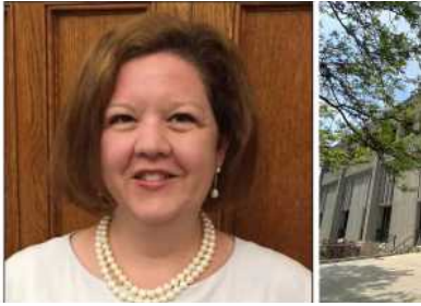
Traverse City Treasurer Fired, Cause Undisclosed; City Commission Vote Required To Uphold Termination

( https://trends.revcontent.com/d=yFTsAM6BaFfla6%2BT4JAG% )