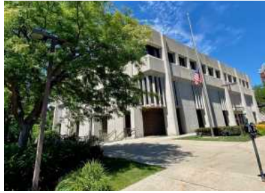
TC Voters To Decide City Manager's Spending Authority

( https://trends.revcontent.com/d=yFTsAM6BaFfla6%2BT4JAG% )