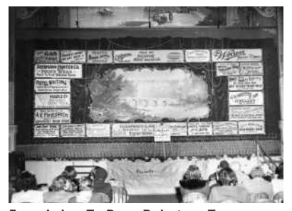
From Labor To Race Relations To Grasshoppers, Traverse City Had A Rough Time 100 Years Ago

(https://trends.revcontent.con d=2ENb9sP1Aet%2Fnf98UFpbL d=z0fQIG7Wj1RB5yyZ8DsigrmZ