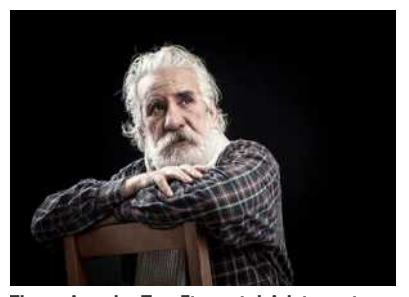
These Are the Top Financial Advisors in Traverse City

(https://trends.revcontent.con d=e9mzSYOHoPVRswgp%2BjTl