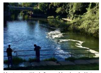
Monitoring Work Starts Monday At Union Street Dam

(https://trends.revcontent.con d=2ENb9sP1Aet%2Fnf98UFpbL d=z0fQIG7Wj1RB5yyZ8DsigrmZ