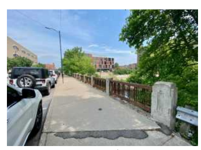
Traverse City Averages $4.5 Million In Projects Annually. This Year? $32 Million